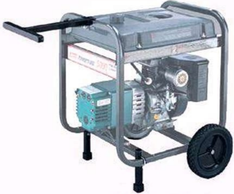
Generator Not Included